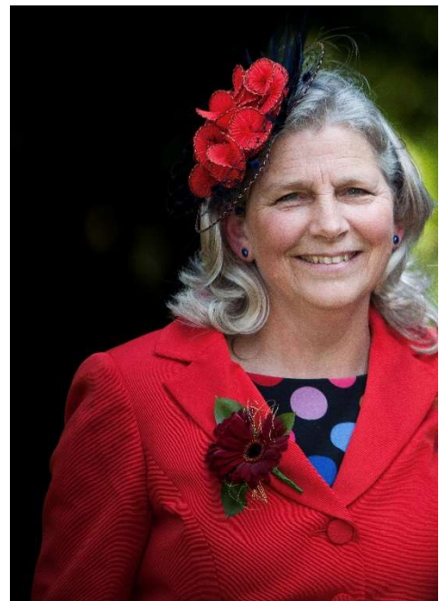
At daughter Rebecca's wedding