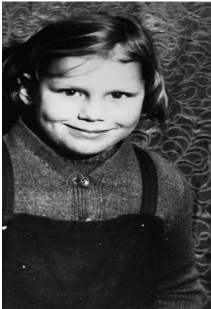
7 years old in Hampshire while living in military married family quarters.