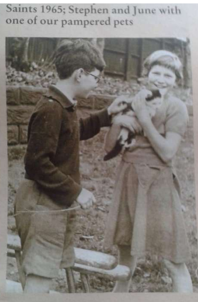
June in Links