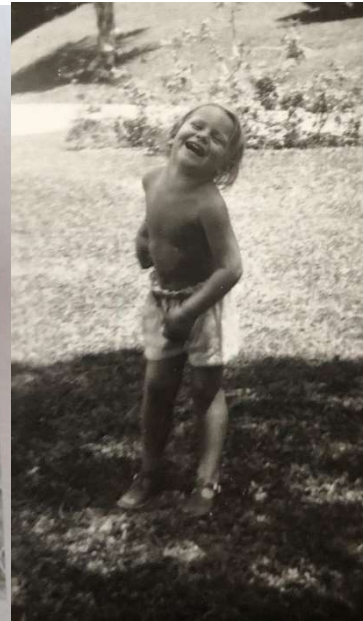
4 years old in Singapore where she was born.